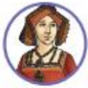
Jane Seymour (died)