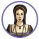
Anne Boleyn (beheaded)