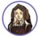
Catherine of Aragon (divorced)