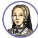
Catherine Howard (beheaded)