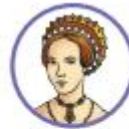
Katherine Parr (survived)