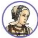
Anne of Cleves (divorced)