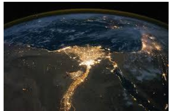
The River Nile from space