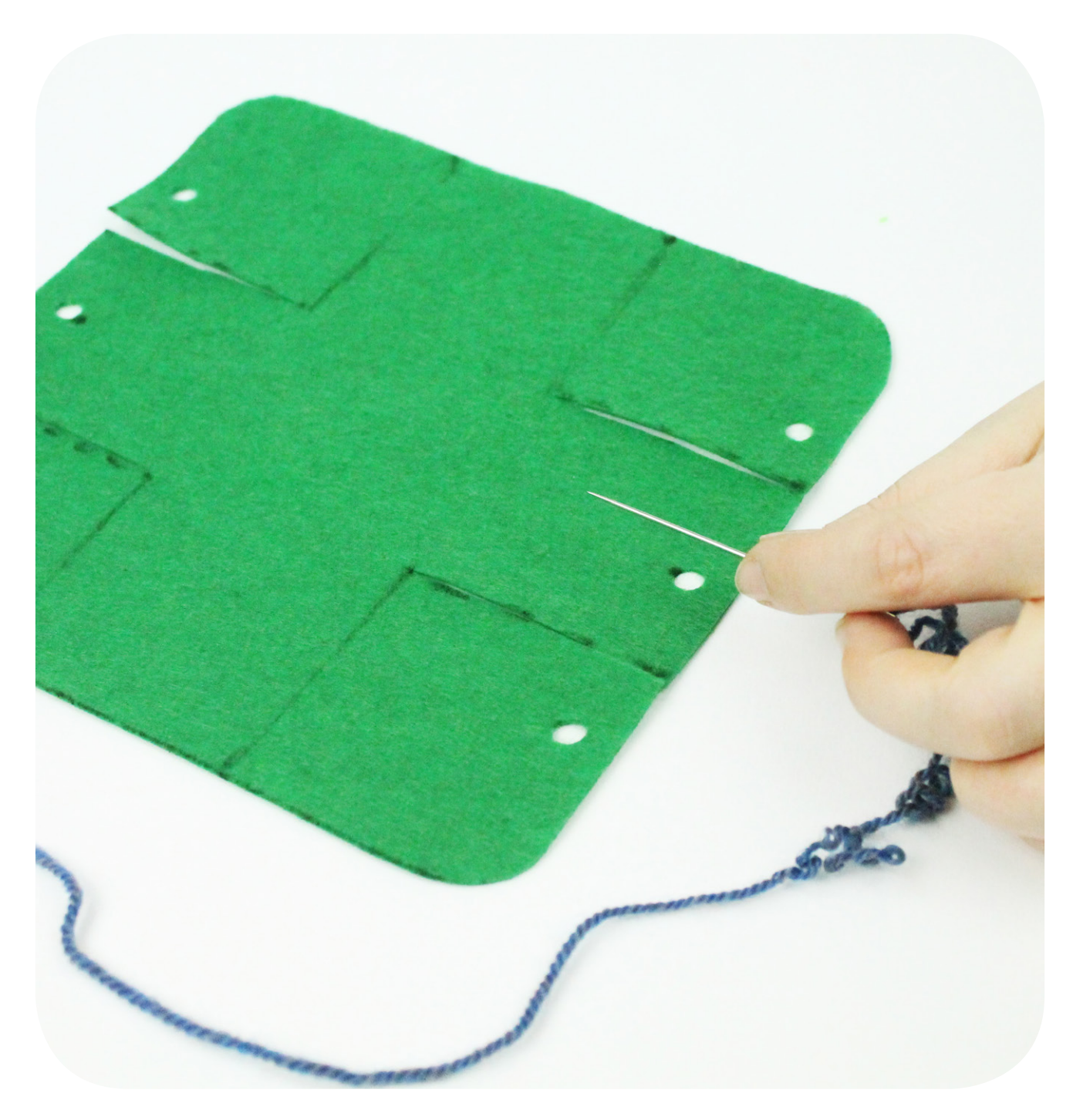
Step 2. Using the template as a guide, use the hole punch to make six holes in the correct places on the felt. Also, use the hole punch to make one hole at either end of the handle.