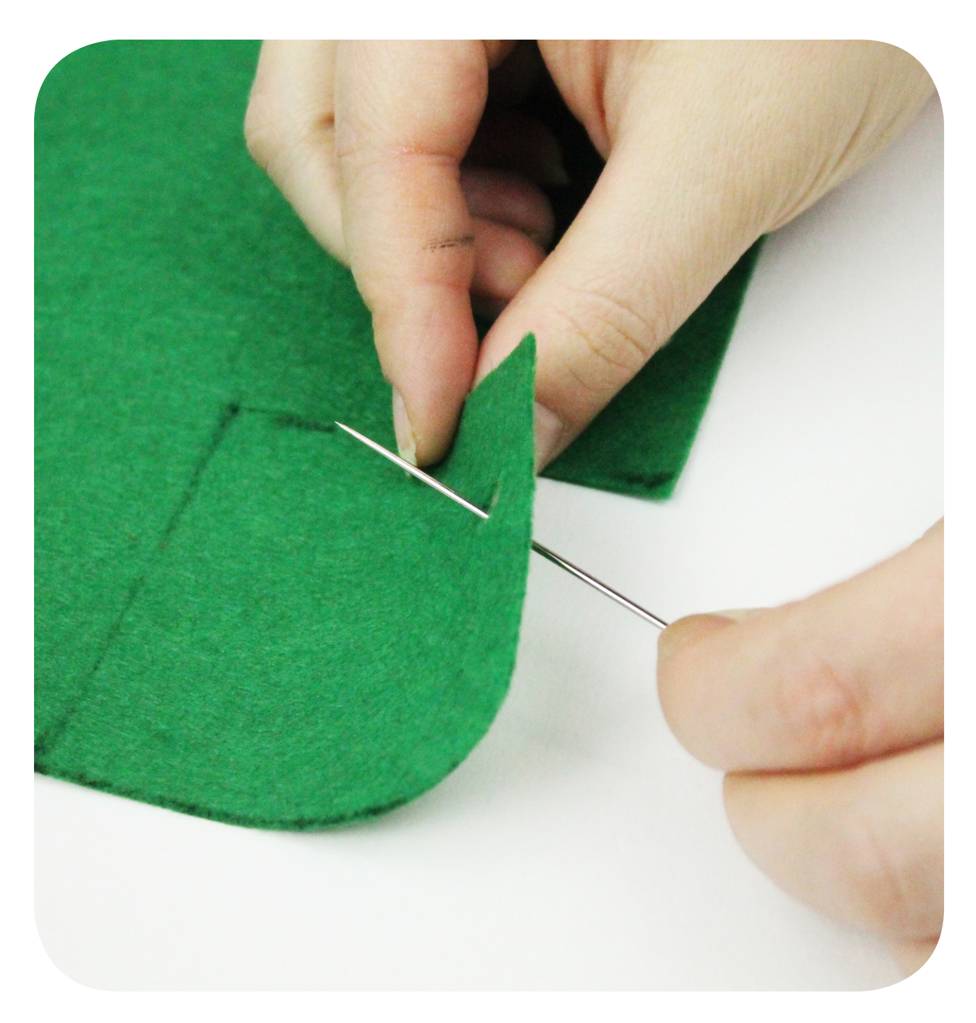
Step 3. Thread a blunt darning needle with wool or string, then thread through the three holes on one end of the basket and gather them together.