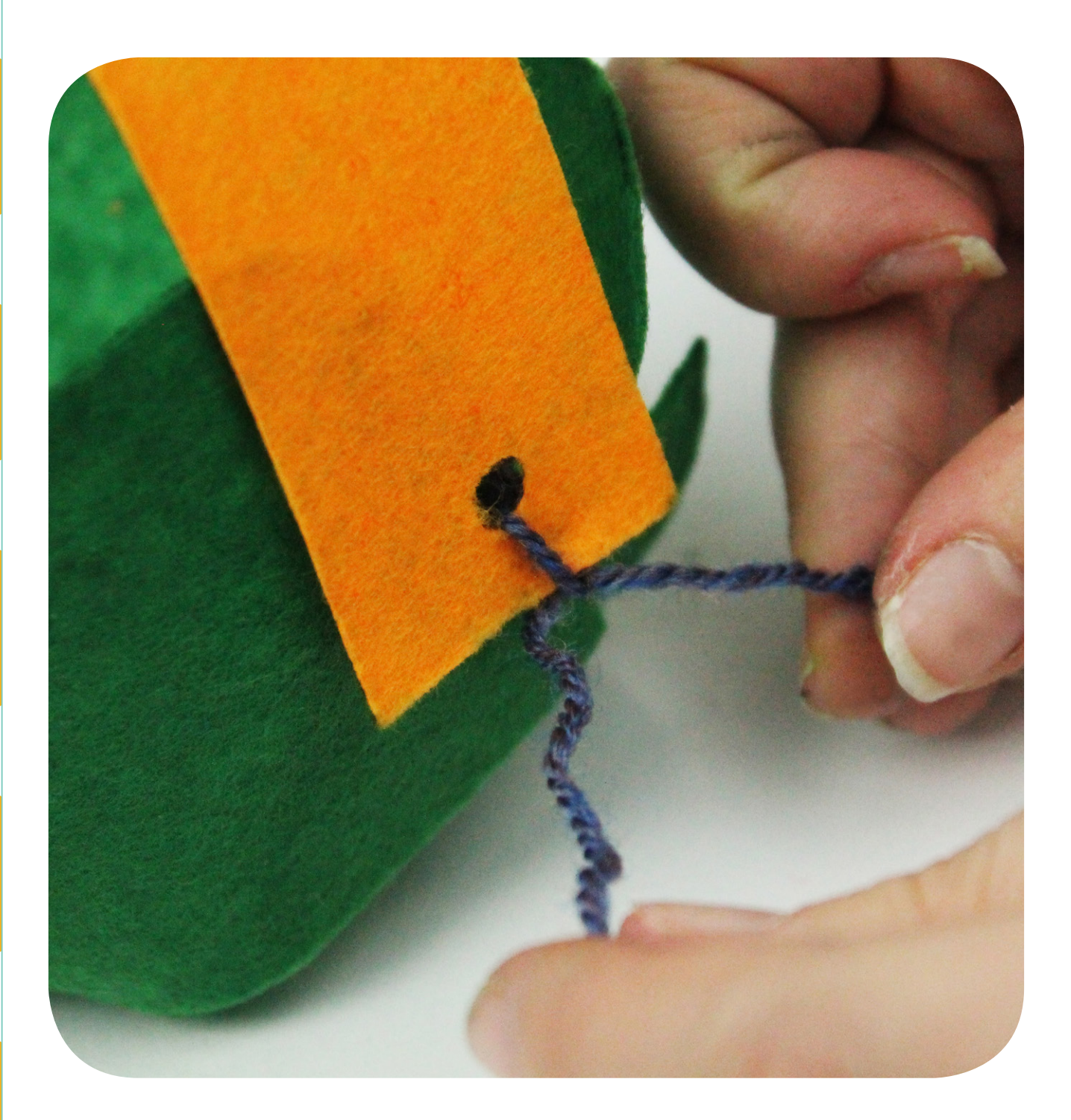
Step 6. Now attach the handle by re-threading the wool on the needle and threading through the holes in the handle, and then through the felt of the basket. Once the thread has gone in and out of both holes, secure the string or wool by tying a knot and trimming the ends.