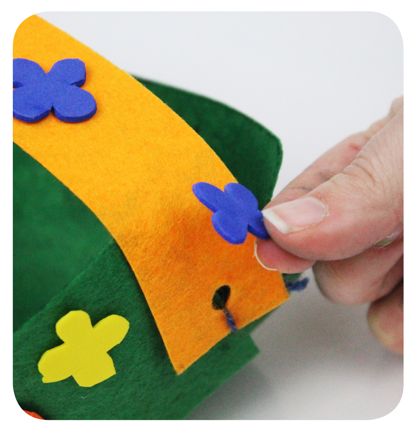
Step 7. Decorate the outside of the box using stickers, fabric sequins and scraps of felt. Attach these using the strong glue.