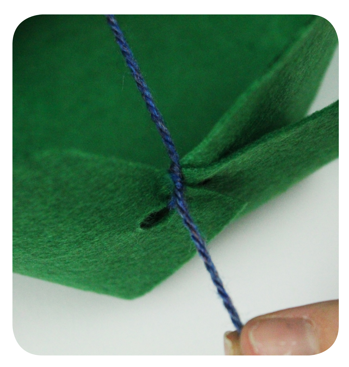
Step 4. Tie a knot in the wool or string and trim the excess off.