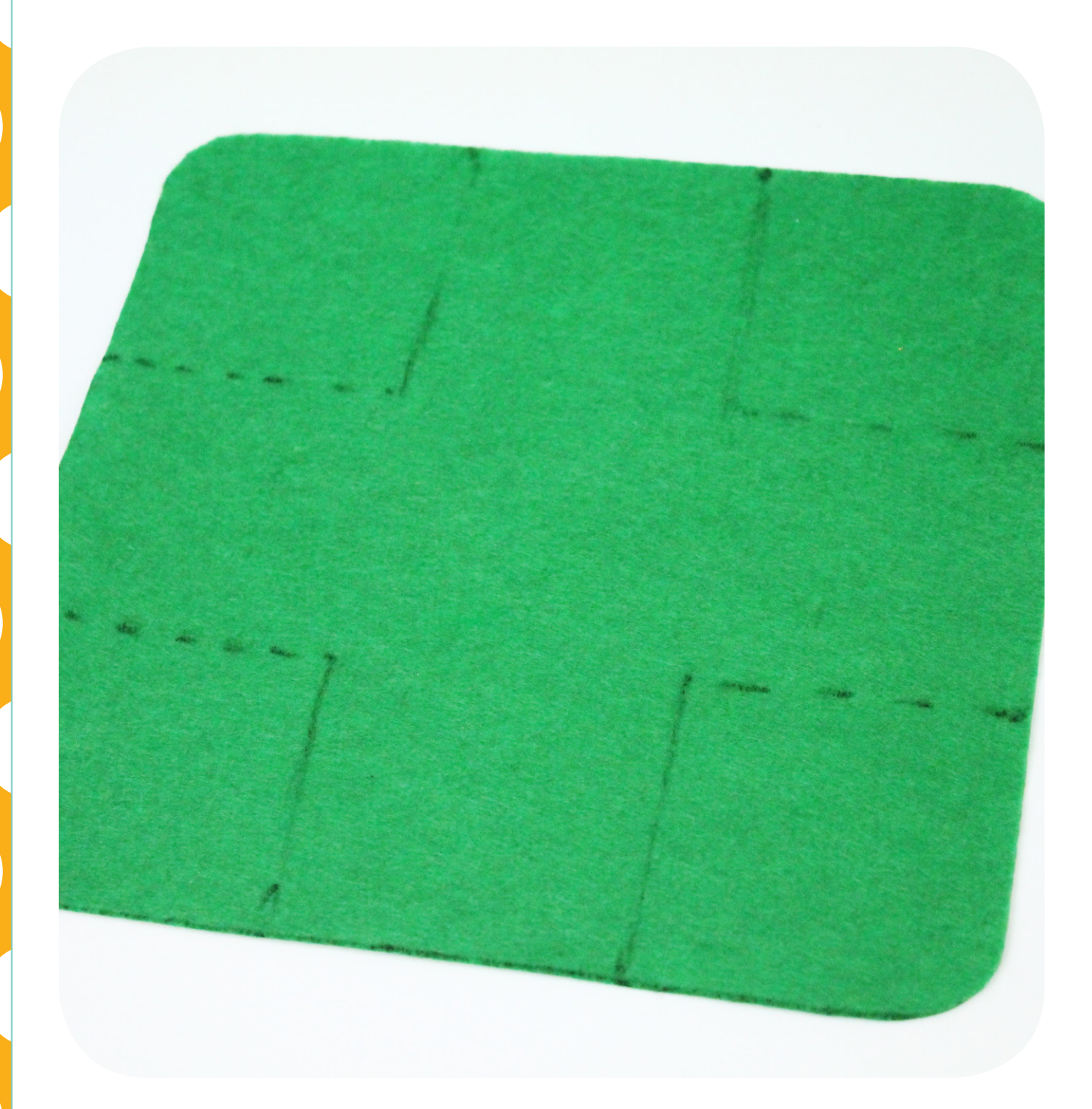
Step 1. Take the large pre-cut piece of felt and using the dotted lines on the template as a guide, cut four lines into the fabric.