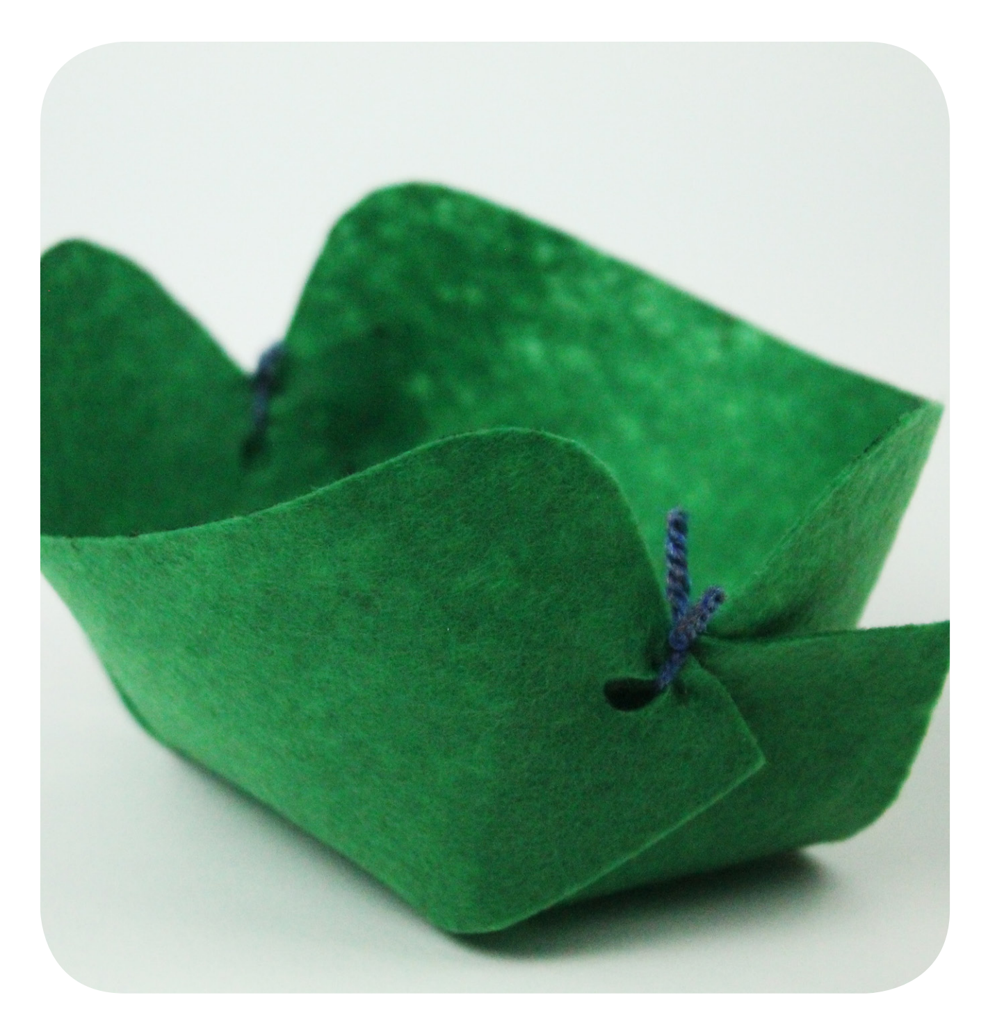
Step 5. Repeat the same as step two but on the other end of the basket.