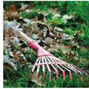
Raking up leaves