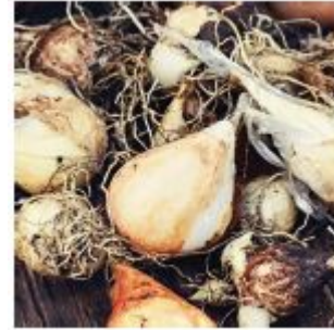
Bulbs ready for planting