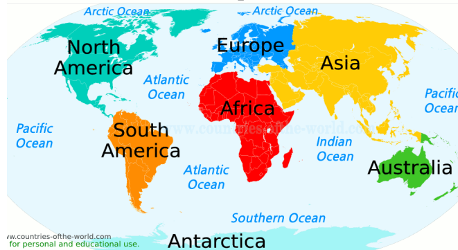
7 continents map with 5 oceans