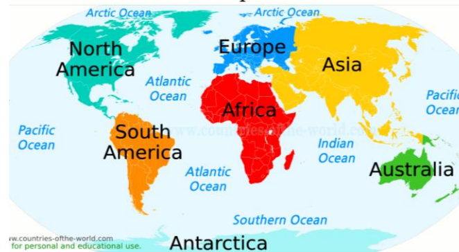
7 continents map with 5 oceans