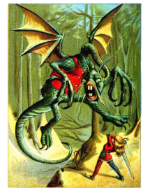
"Beware the Jabberwock, my Son."