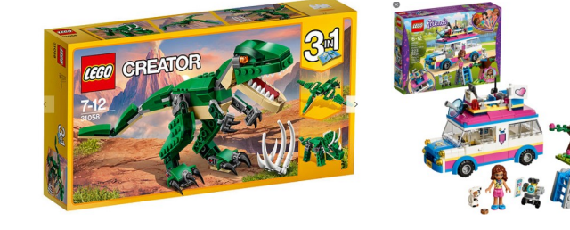
We need your help!

We need lots of small, complete Lego sets, containing instructions, to be able to run our Lego based therapy. If you have any Lego sets that you would like to donate to school we would be extremely grateful.