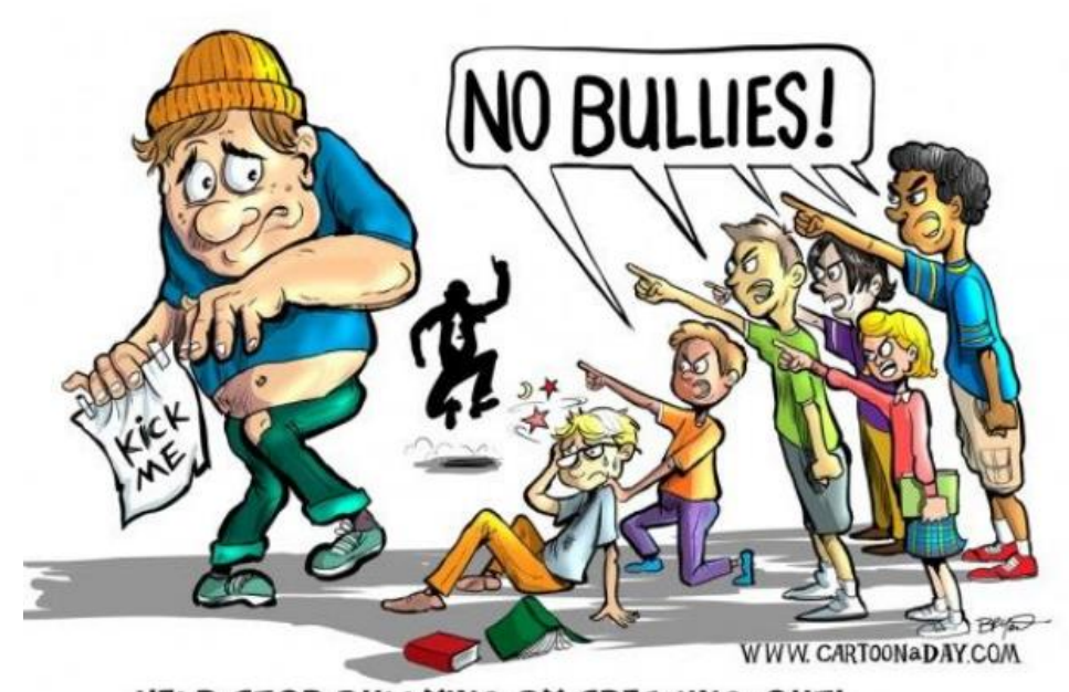
HELP STOP BULLYING BY SPEAKING OUT!