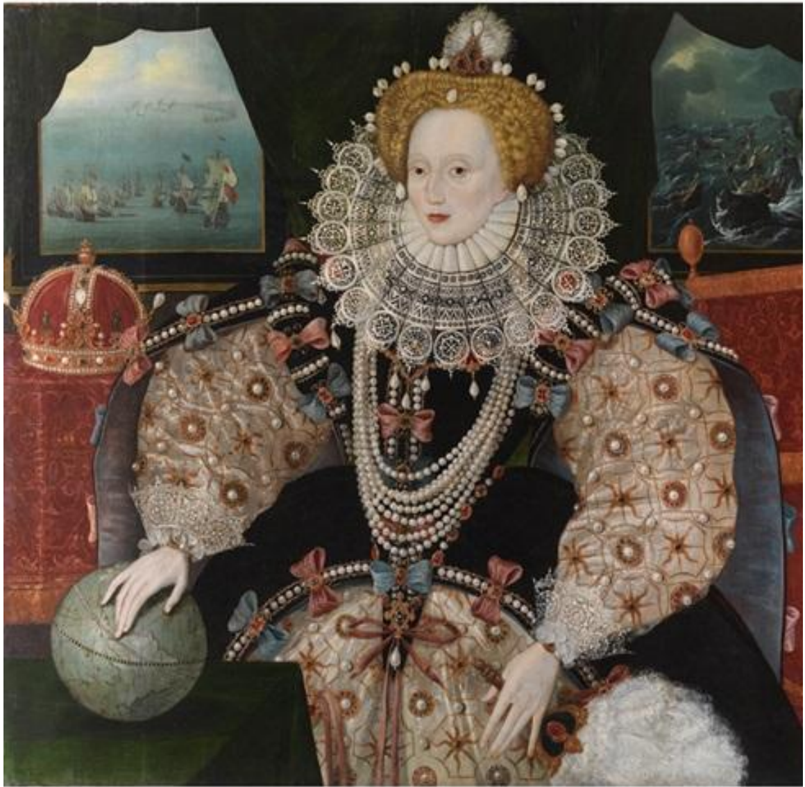
The Armada Portrait