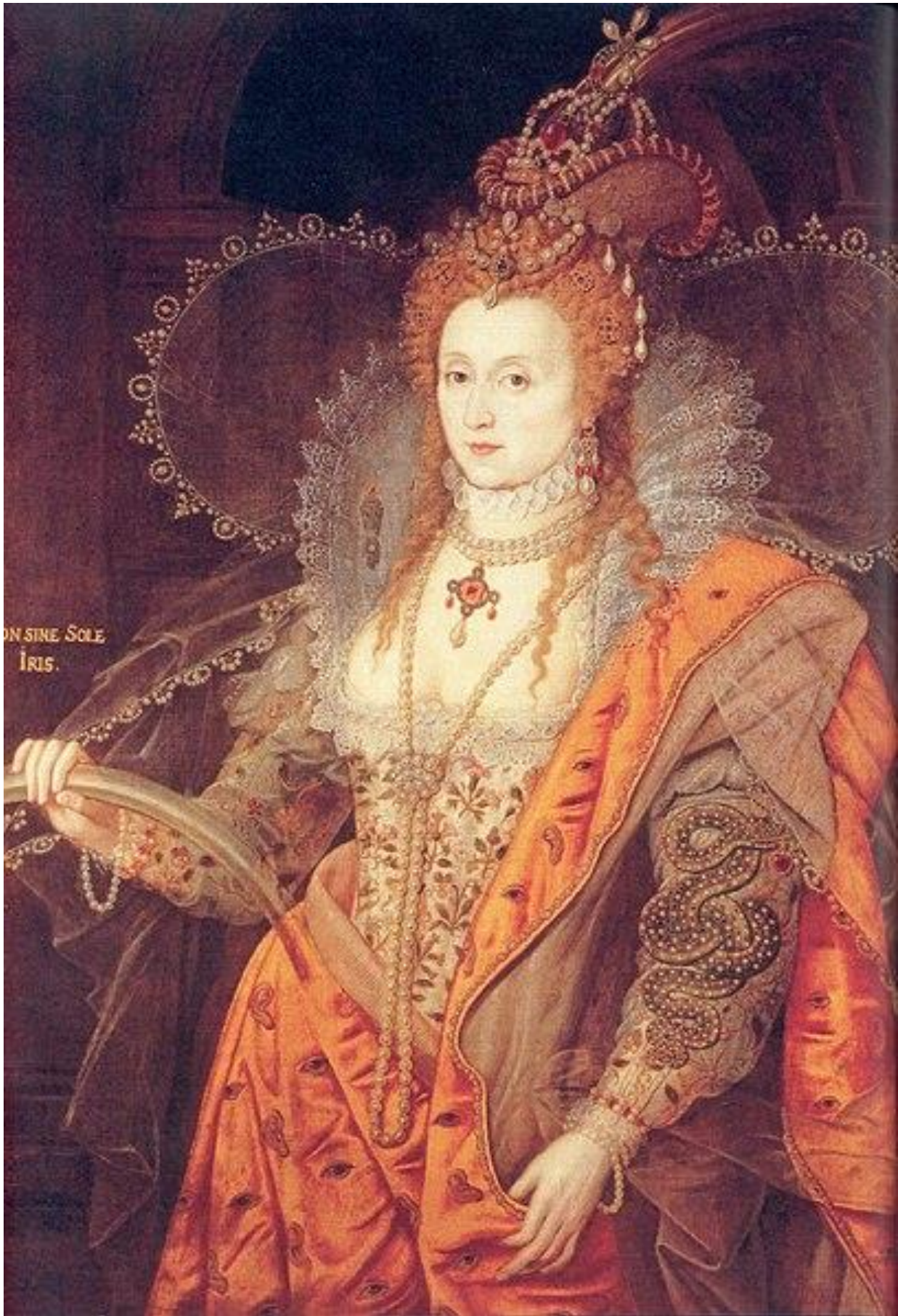
The Rainbow Portrait