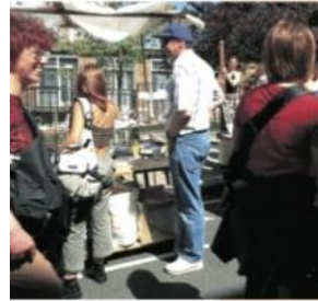
Our friends of Jesus preached the good news in the market place or wherever people gathered.

We took a ship from Troas and sailed to Samothrace. The next day we went on to Neapolis and from there sailed inland to Philippi. It is a Roman colony and the most important city in Macedonia. We spent a few days here. On the Sabbath we went outside the city gates to a place by the river where the Jews gathered to pray. We sat down and talked to the women who had come there. One of them was called Lydia. She was from Thyatira and was in the business of dying and selling purple cloth. She loved and worshipped God and listened carefully to us. God opened her mind and heart to believe what Paul said. After she and all the people who lived in her house had been baptised, she invited us to stay with them.