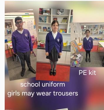
school uniform girls may wear trousers