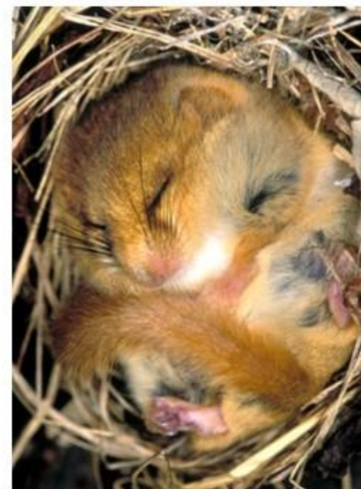
Pictured: A hibernating dormouse.