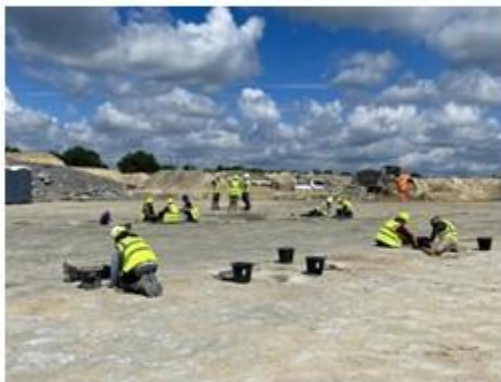
Pictured: The excavation team on site at Dewars Farm Quarry.

The UK's biggest ever dinosaur trackway site has been excavated at Dewars Farm Quarry, Oxfordshire. Over 200 dinosaur footprints have been discovered, including those of Megalosaurus (a large, meat-eating dinosaur that walks on two legs) and Cetiosaurus (a plant-eating sauropod dinosaur that walks on four legs). Imprinted into the limestone floor around 166 million years ago, five