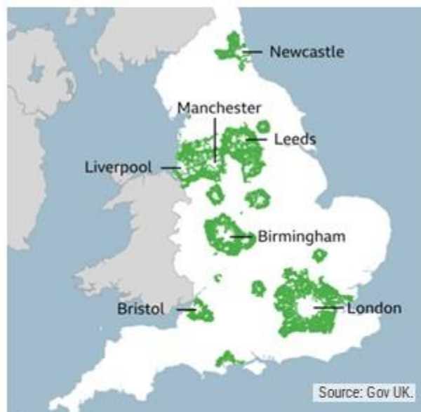
Pictured above: England's green belt as of 31 st March 2023.

Grey belt land is land that was previously developed, for example, a car park or industrial area, no longer in use.