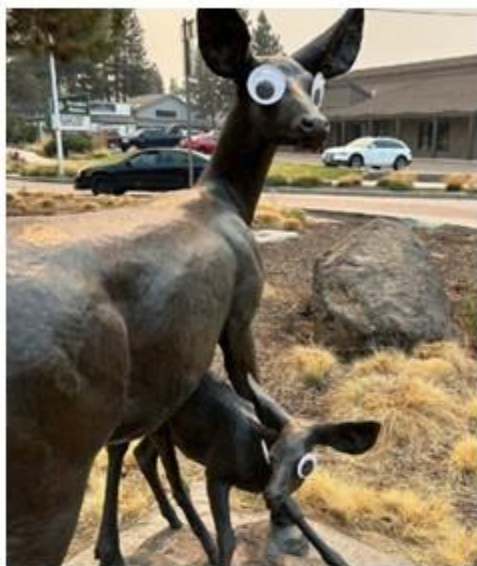
Pictured: Googly-eyed sculptures in Bend, Oregon.

In the city of Bend, Oregon, some people have been adding googly eyes to statues! The funny plastic eyes appeared on sculptures, like a statue of two deer and a giant metal sphere, making the artworks look quite silly. But the city council isn't laughing. They've asked people to stop because it costs a lot of money to remove the eyes without damaging the art. 'While the googly eyes [...] might give you a chuckle, it costs money to remove them with care to not damage the art,' said a council spokesperson. The council explained that decorations like Santa hats and wreaths have