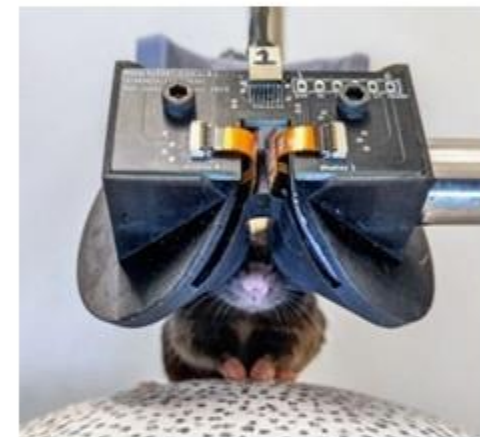
Pictured: MouseGoggles being worn by a mouse.