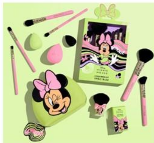
Pictured: Spectrum's Minnie Mouse collection.