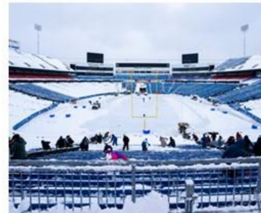
Pictured: American football fans work together to clear snow from the Highmark Stadium in Buffalo.

A huge snowstorm hit parts of the US over the Thanksgiving holiday weekend, with some places getting over three feet of snow! In Buffalo, New York, people grabbed shovels to help the Buffalo Bills American football team clear their stadium before a big game. Governor, Kathy Hochul, said, 'The snow is heavy, but New Yorkers are tougher!' Snowstorms like this are known as lake-effect snowfall; they happen when cold air blows over the Great Lakes, creating fluffy snow. Some areas can see up to six feet of