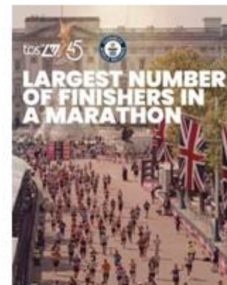
Pictured: The TCS London Marathon has broken the Guinness World Records title.