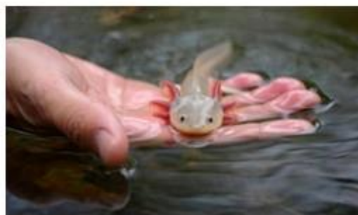
Pictured: An axolotl.

Do you know any facts about axolotls? How would you feel if you saw an axolotl in real life?