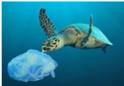
Pictured: A sea turtle eating plastic.

Last Friday, it was Endangered Species Day, a day to learn about animals that need our help. These animals are called endangered species, which means there aren't many of them left, and they could disappear if we don't do something to help. Some endangered animals include tigers, rhinos, pandas, elephants – and turtles! This Friday is World Turtle Day, a special day to celebrate turtles and find out how we can help them. Turtles are clever, gentle animals. Some live in the sea, and some live on land. They have been on Earth since the time of the dinosaurs! But today, many turtles are in danger and one big problem is