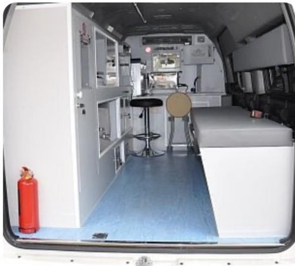
Pictured above: What the refitted popemobile could look like inside, based on another mobile health unit.