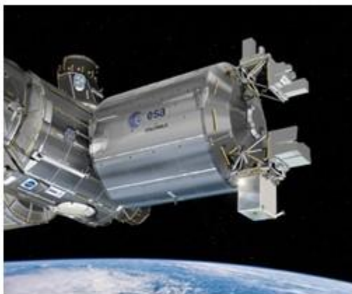
Pictured: The European Space Agency (ESA) Columbus laboratory.

Astronauts might one day eat meals like steak and mashed potatoes made in space; not cooked but grown in a lab! The trial is led by the European Space Agency (ESA), which is exploring new ways to support future space missions. A new trial has launched to test lab-grown food in the orbit. Lab-grown food is made from animal or plant cells, instead of using traditional farming. Scientists hope this could help astronauts eat well without needing to send lots of supplies from Earth. The experiment was built by Frontier Space