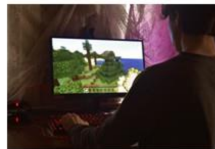
Pictured: Someone playing Minecraft on their computer.

Some even looked at planning documents and contacted real organisations to make sure their buildings were as accurate as possible. The team started in 2020, when the original idea was to recreate the entire Earth in Minecraft. That's now been scaled back but the project still encourages players to build places that matter to them. Minecraft is the