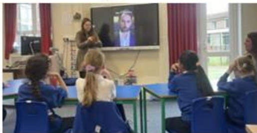
Pictured: A Picture News session in action at Doncaster School for the Deaf.

This week is very important, as it's Deaf Awareness Week! This week is a special time when we can learn more about deaf people's stories and experiences, including how they communicate, and lots of other amazing things about the deaf community! It's also a chance to think about how we can be good friends by making sure everyone feels included. Deaf people don't hear sounds in the same way as hearing people. Some people can hear a little bit, and others might not hear anything at all. Some people use hearing aids to help them, and some use sign language to communicate. Sign language is a brilliant way to talk using your hands, faces, and bodies instead of voices. It's a beautiful language you can see! There are schools where children use sign language all day, such as Doncaster School for the