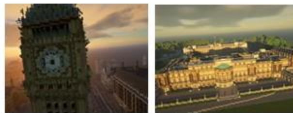
Pictured: Famous UK landmarks built by Minecraft players.

A group of Minecraft players have spent the past five years building the whole of London inside the game! They are part of a global project called Build The Earth, where players work together to recreate real-life places using Minecraft blocks. The UK team has built famous landmarks, like the Houses of Parliament and Buckingham Palace, along with streets and boroughs across London. The builders have spent over 15,000 hours on the project so far.