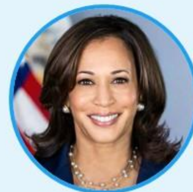
@KamalaHarris on X.

Learn more about this week's story here . Watch this week's useful video here . This week's Virtual Picture News here .