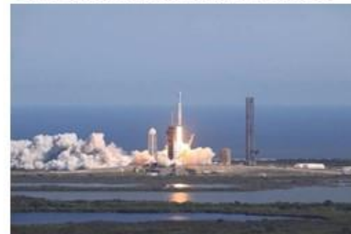
Pictured: Europa Clipper mission successfully launching aboard a SpaceX Falcon Heavy rocket from Kennedy Space Centre.