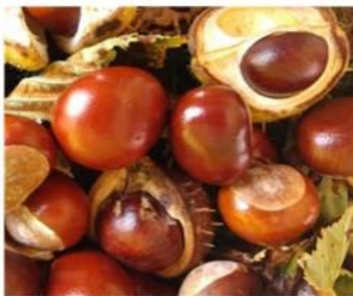
Pictured: Conker collection.

Why not challenge your friends to a game of conkers?