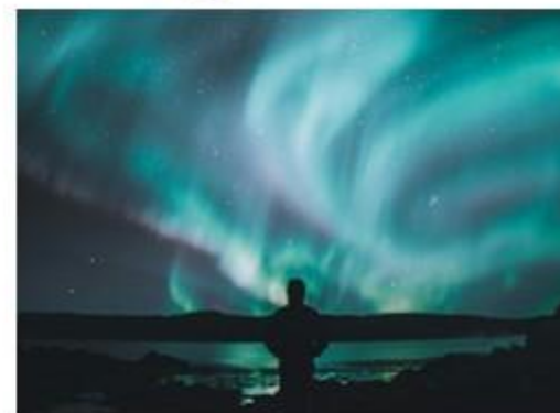
Pictured: Northern lights display.

People in the UK have been treated to some incredible light displays this year as the northern lights have been visible across the country. The lights, also called the aurora borealis, could be seen as far south as London, which doesn't happen very often. The northern lights are created when tiny particles from the Sun mix with gases in the Earth's atmosphere, making beautiful colours like pink, green, and purple. This year, there have been more sightings in the UK because of special activity on the Sun. Professor