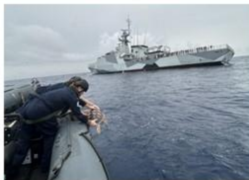
Pictured: The turtles being returned to their natural habitat by the HMS Medway.

Six rare turtles, that were blown off course by a storm, have been returned to their original habitat thanks to the Royal Navy. Royal Navy patrol ship, HMS Medway, assisted in the repatriation of six loggerhead turtles, called Jason, Gordon, Perran, Hayle, Holly and Tonni! The turtles were thousands of miles away from home when they were rescued and nursed back to health by carers at Newquay Blue Reef Aquarium and Anglesey Sea Zoo. HMS Medway was able to transport them back to their home in the Azores, during its transatlantic crossing on the way to the Caribbean.