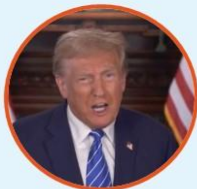
@realDonaldTrump on X.

People in the USA will head to the polls on Tuesday 5 th November to elect the next US president. The vote will be closely watched around the world. The winner will serve a term of four years in the White House, starting in January 2025. On the world stage, the US leader has a lot of freedom to represent the country overseas and to conduct foreign policy.