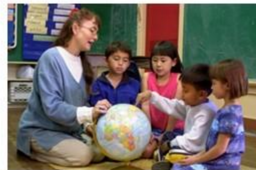
Pictured: Teacher and students with a globe.