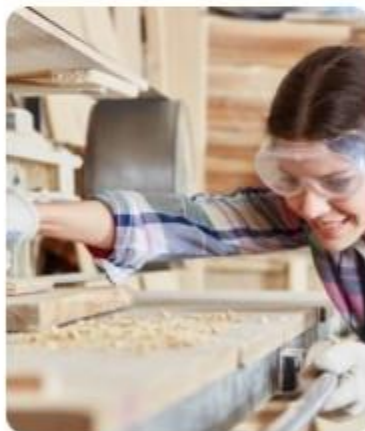
A joiner working flexitime.

I have a job share. We work really well together and because we have different strengths and skills, we both bring a great deal to our role. It also means I can spend time with my young children on the days I am not working.