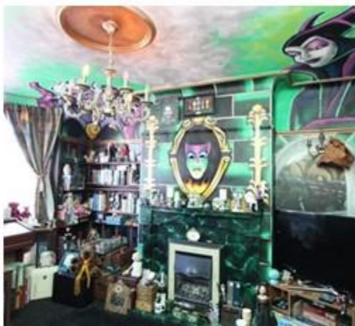
Pictured: The interior of the Disney themed house.

A uniquely decorated home has gone viral after it was put up for sale by its Disney superfan owner! The estate agents in charge of selling the home posted that their advertisement had gone global: 'Our property listing has captured the world's attention, and we couldn't be more thrilled! 🇬🇧' The Disney-themed home features huge murals of famous characters, such as Aladdin, Mary Poppins and Peter Pan. The property is in the Welsh seaside