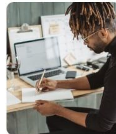
A graphic designer working from home.

Were you aware there are so many different types of flexible working? Do you think you would choose to work flexibly? Why?