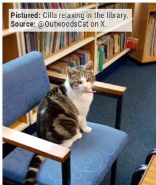
Pictured: Cilla relaxing in the library.