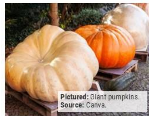
Pictured: Giant pumpkins.

Have you spotted any pumpkins? Were they giant?