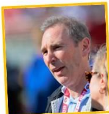
Pictured: Andy Jassy.

The advantages of being together in the office are significant... in summary, we've observed that it's easier for our teammates to learn, model, practice, and strengthen our culture... teaching and learning from one another are more seamless; and, teams tend to be better connected to one another.