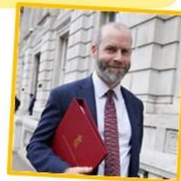
Pictured: Jonathan Reynolds.

UK Business Secretary, Jonathan Reynolds.