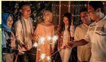
Muslims celebrating Id-ul-Fitr,

There is no god but Allah and Muhammad is his Messenger