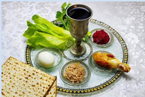
The Seder plate at a Pesach Meal