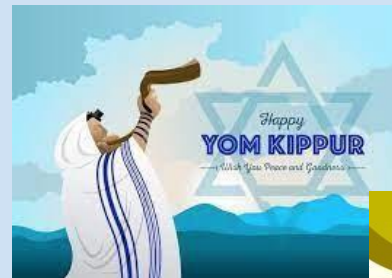
A Jewish man plays the Shofar on Yom Kippur