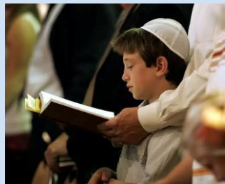
A Jewish child prays at the synagogue