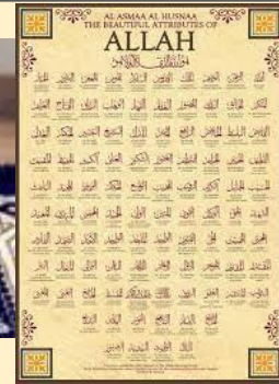
99 beautiful names of Allah in Arabic