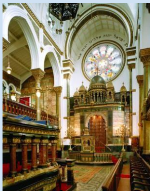
The inside of a synagogue in London