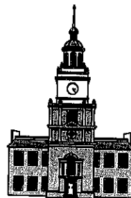
Town Hall Height: 144 metres

How much taller is City Tower than Town Hall?