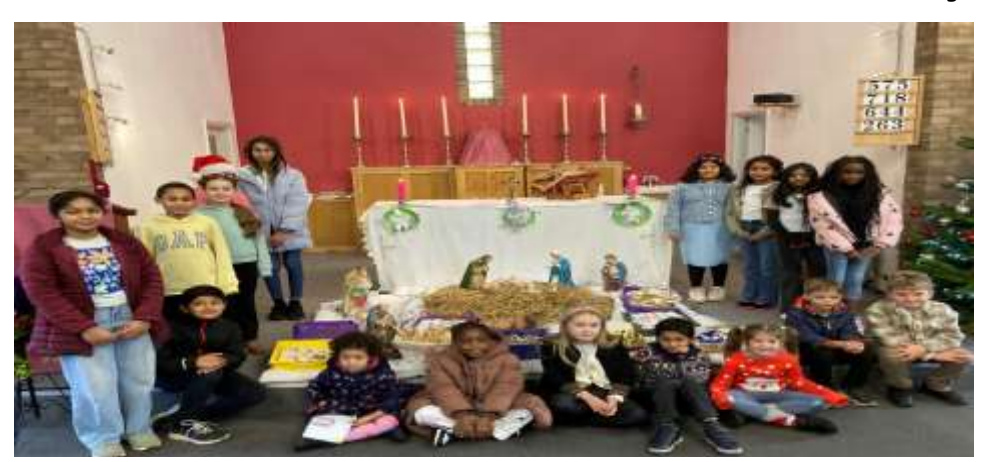
Sunday 15<sup>th</sup> December Blessing of the Bambinelli on Gaudete Sunday