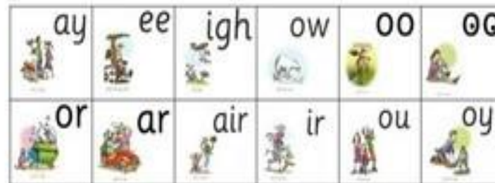
Set 2 Sounds