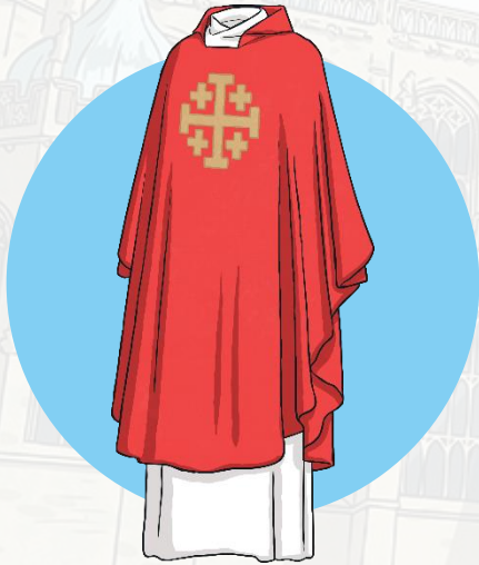
Vestments - Robes worn by a priest.

Colours are displayed in different areas in a church. Click on the picture to find out more.