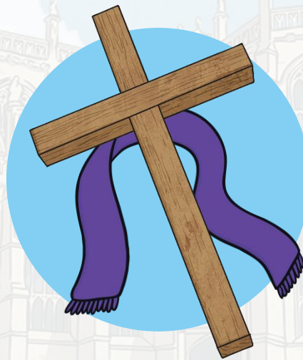
Cross (with a piece of material draped around it) - A symbol of Jesus' death on the cross.