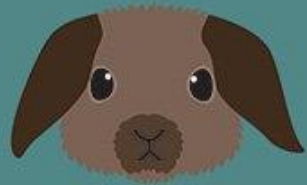
American Fuzzy Lop