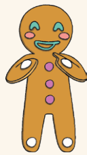
The Gingerbread Man