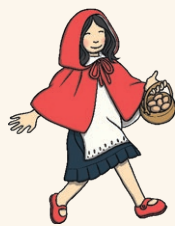
Little Red Riding Hood