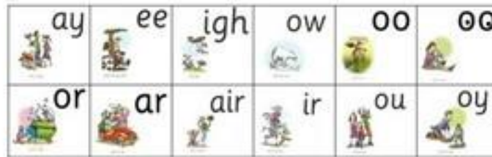
Set 2 Sounds