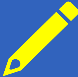
Pencil or pen