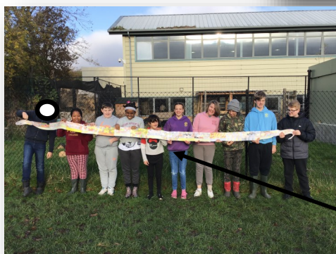
S3A holding a 5m long python!