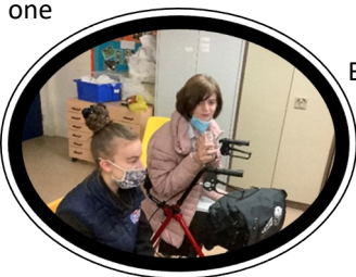
BY LUCY S5A