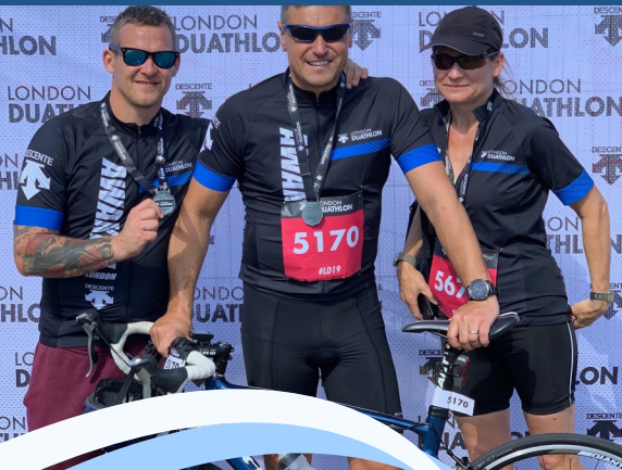
Team Wheels on the Bus

The school has a small supply of uniform for sale at a slightly discounted price. Please call the school office or email for a list of items.