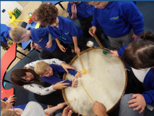
Rainbow Fish Class