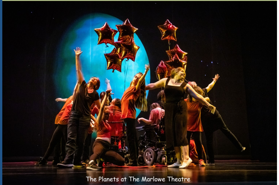
The Planets at The Marlowe Theatre