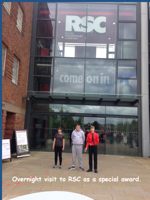
Overnight visit to RSC as a special award.

Some of our students are performing the first Concert of the year on Wednesday 16 October here at the School. We are very excited and looking forward to the rest of this academic year.