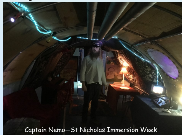
Captain Nemo—St Nicholas Immersion Week