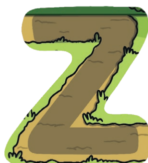
Zig, zag, path.