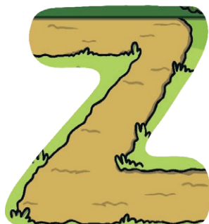
zig zag path