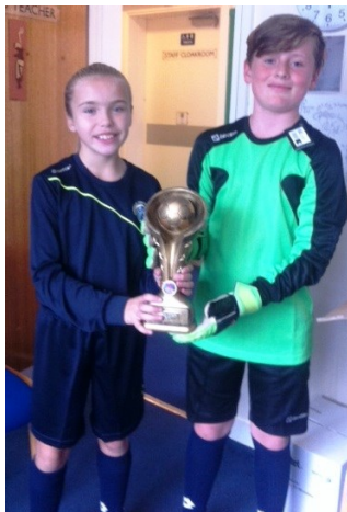
Sneak preview of our new Football Kit

Friday is also the last day in school before the half term, we hope you all enjoy the break and we look forward to seeing you again on Monday 31st October.