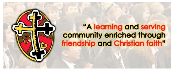
St. Peter's Catholic High School Mission Statement

This information is intended to give you an outline of the process which we use. The exact pathway will vary from subject to subject. We will also refine our target setting for individual pupils as more information becomes available.