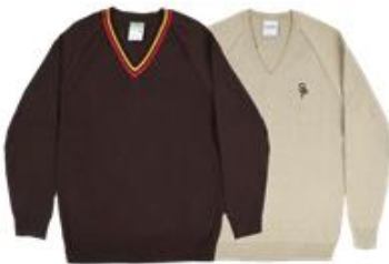
Jumper (Y7-Y10 Optional) Y11 Jumper (Compulsory)