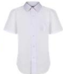
White Shirt Tucked in Top button fastened