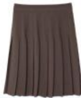
Brown Skirt (Knee length) Worn with plain brown tights or plain white ankle socks