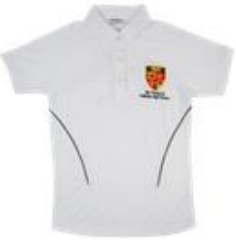
White T-Shirt with badge