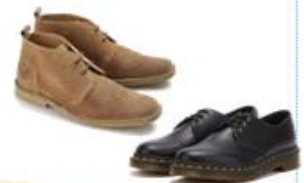
Black/Brown School Shoes No trainers, pumps or ballet shoes (see website for examples) Black/Brown Ankle Boots (with trousers only)