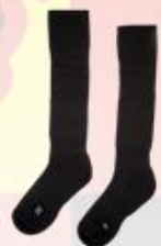
Black Football Socks