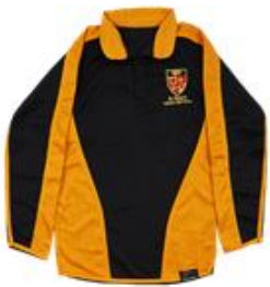
School Rugby Shirt (Outdoors)