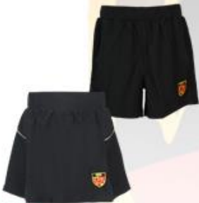
Black Shorts (School supplier only) Black Skort (School supplier only) Black Leggings with School badge (School supplier only) Black Tracksuit Bottoms (outdoor) (School supplier only)