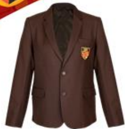
Blazer (Compulsory for Y7-Y10)