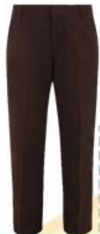
Brown Trousers Brown socks to be worn