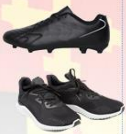
Trainers and Moulded Football Boots