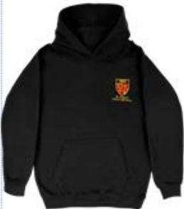
Black School Hoodie with badge