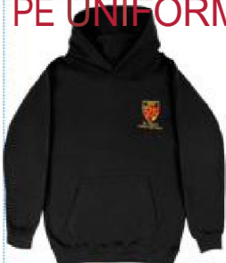
Black School Hoodie with badge