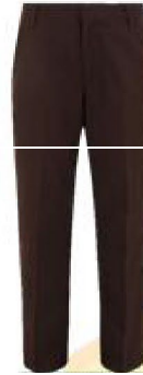
Brown Trousers -- Must have a utility pocket. Brown socks to be worn