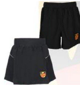
Black Shorts (School only)