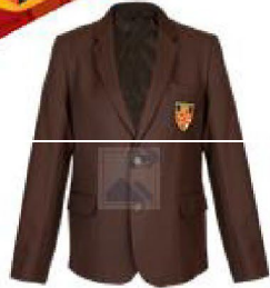
Blazer (Compulsory for Y7-Y10)