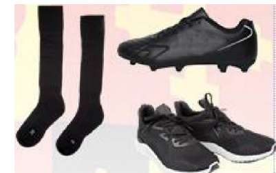
Black Football Socks