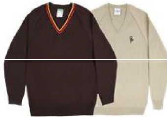
Jumper (Y7-Y10 only) Y11 Jumper (Colours)