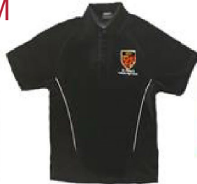
Black T-Shirt with badge