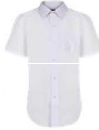
White Shirt buttoned down, long-sleeved