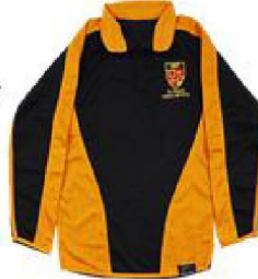
School Rugby Shirt (Outdoor)