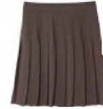
Brown Skirt (Knee length) Worn with plain brown tights or plain white ankle socks