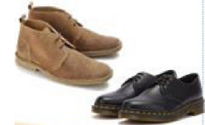
Black/Brown School Shoes No trainers, pumps or high heels (see website for examples)