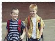
Go home from school