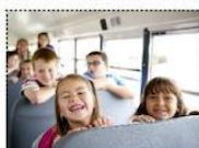
Leave for school