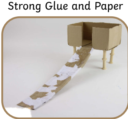
Strong Glue and Paper