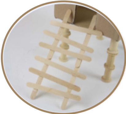
Wooden lolly sticks