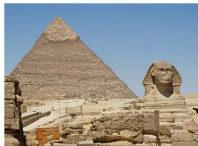
A pyramid behind a Sphinx

The ancient Egyptians were a North African civilization. This civilization grew and developed hugely over years. In all, there were over 30 centuries of ancient Egyptian royal dynasties from around 3100 BC, before the Romans became their rulers.