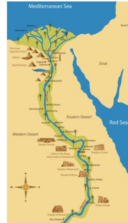
Egypt is a country in North Africa