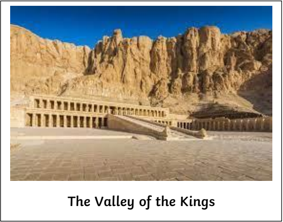
The Valley of the Kings

Howard Carter Born in 1874, London. Egyptologist famous for discovering the tomb of Tutankhamun in 1922