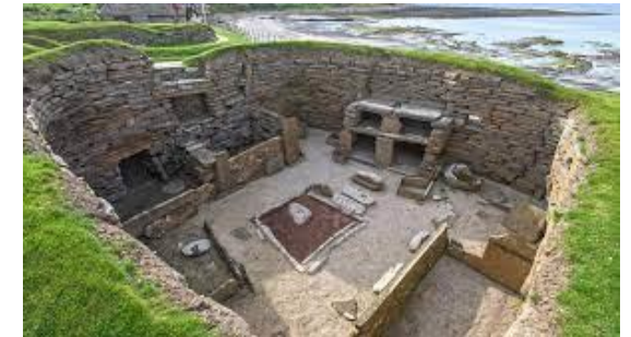
Skara Brae, which is older than Stonehenge, is in the Orkney Isles, Scotland.

Religion and Trade continued to develop and large round megaliths, like Stonehenge, were built!