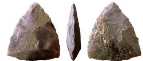
Stone Age Tools