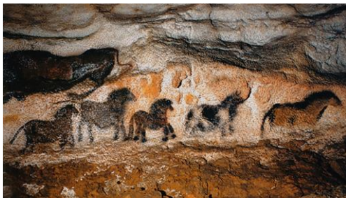
The Lascaux Caves

They created cave paintings – the Lascaux Caves are famous for hunting scenes and the Cave of Hands for handprints. They developed tools from stone, bone and wood, such as spears and axes, to help with hunting and daily life. Stone tools were made by flint napping stone to make an edge or sharp point.