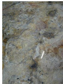
Mesolithic footprints on the coast of Howick in Northumberland