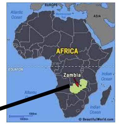
Zambia is a <u>land locked</u> country in southern Africa.