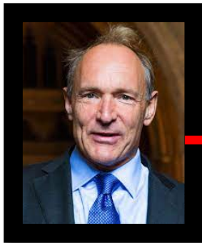
Tim Berners-Lee London