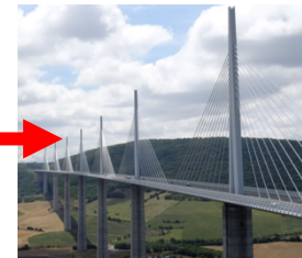
Reinforced Concrete, 1853