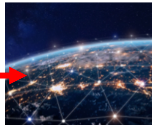
World Wide Web, 1990