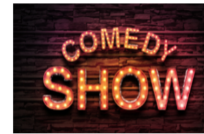
Bulb Lettering Sign