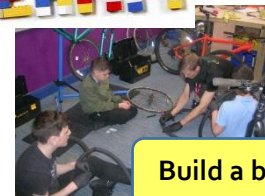
Build a bike