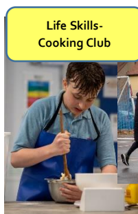
Life Skills- Cooking Club