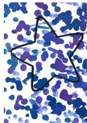
Tulip: All Year Notecard

Snowdrop Class: Winner for entry into the Camden Local Authority Contest