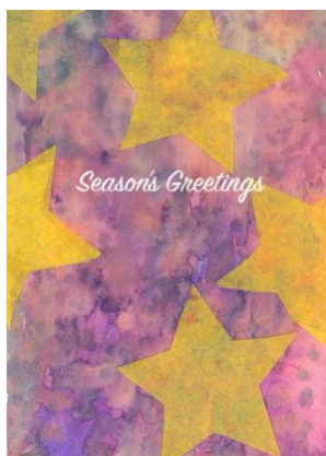
Bluebell Class (Aarav)