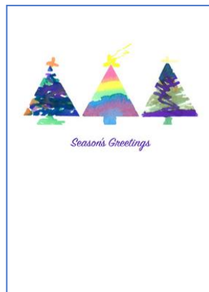
Tulip, Obama, Blossom