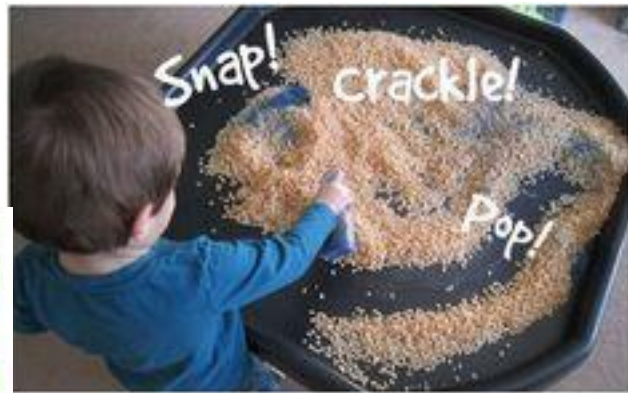
Noisy Rice Krispies Tuff Spot