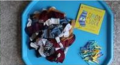
Pondering Playtime Simon Sock Pairs Activity