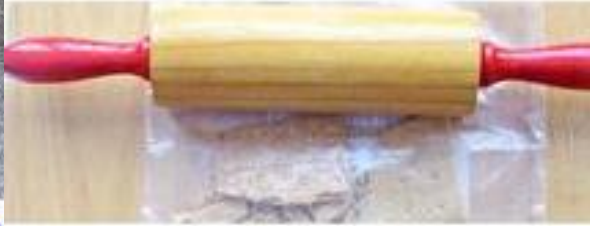
kids-in-the-kitchen Rolling Pin Sensory Activity