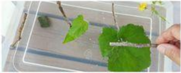
Sink and Float with natural materials