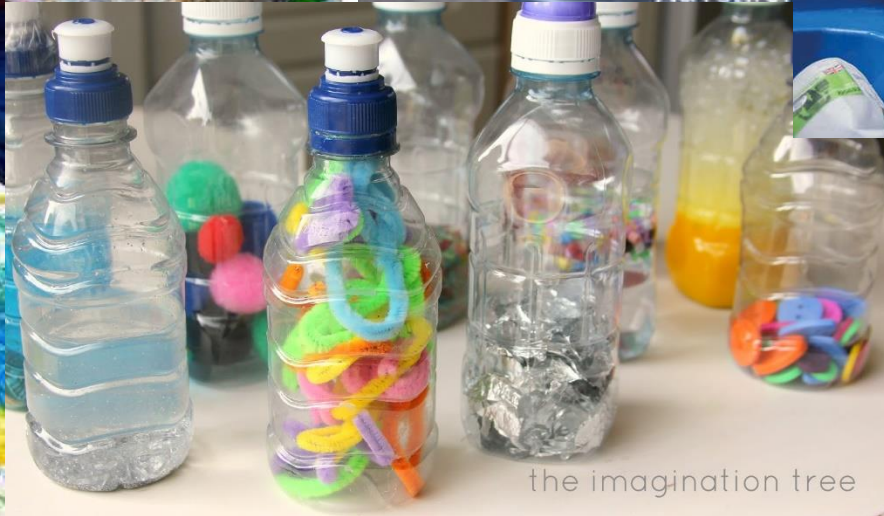
the imagination tree