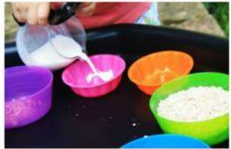
Sensory Play with Porridge Learning and Exploring Through Play