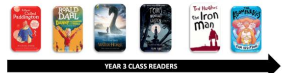
YEAR 3 CLASS READERS