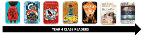
YEAR 4 CLASS READERS