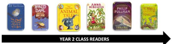
YEAR 2 CLASS READERS