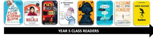
YEAR 5 CLASS READERS