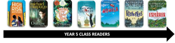
YEAR 5 CLASS READERS