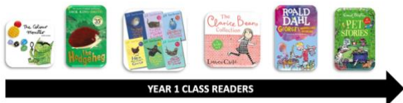
YEAR 1 CLASS READERS