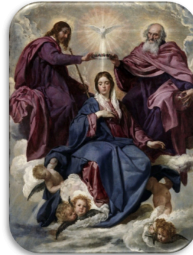
The Coronation of the Virgin by Velazquez