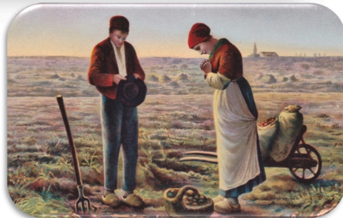
The Angelus by Millet

'Pray then like this: "Our Father in heaven, hallowed be your name."