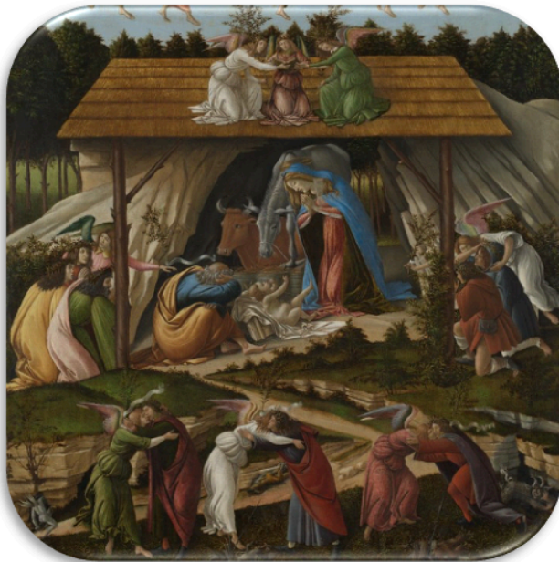
Mystic Nativity by Sandro Botticelli