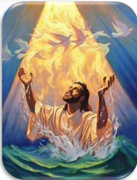
The Baptism of Jesus by Jeff Haynie