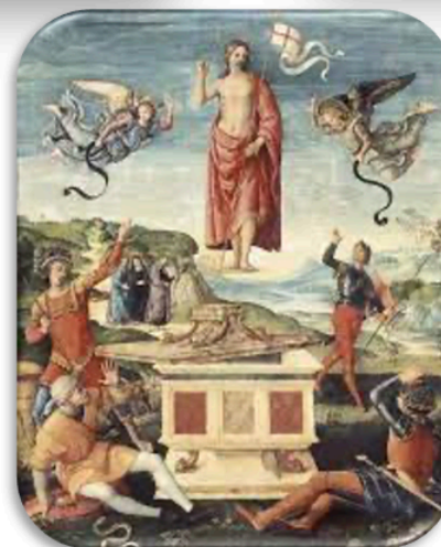
Resurrection of Christ by Raphael