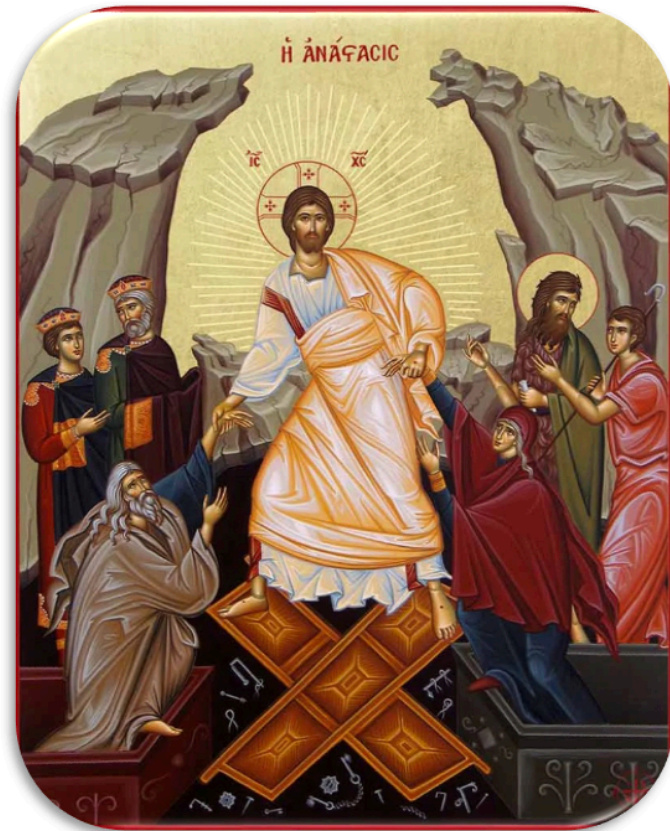
The Icon of the Resurrection

'Saying, "The Lord has risen indeed, and has appeared to Simon!"'